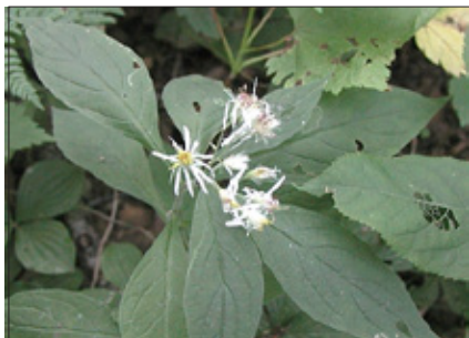
Whorled Wood Aster

Another aster, Whorled Wood Aster , is blooming in the woods.