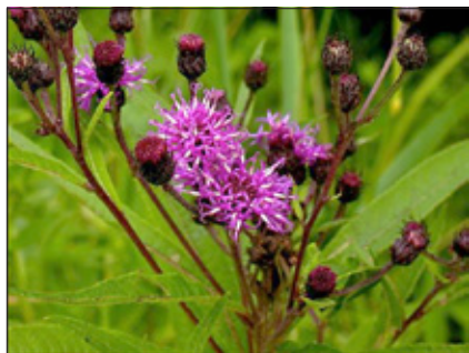
New York Ironweed

Beekeepers provide homes for honey bees in exchange for honey, beeswax, and pollination. Honey bees are unlike most other insects because they overwinter as a colony . Wasp colonies, except in the tropics, die out in autumn after raising hundreds of queens. The queens that survive winter start new wasp colonies. Honey bees can winter over as colonies because they store honey in reusable wax honeycomb. The colony eats the stored honey and survives cold winters without needing blooming flowers. Successful honey bee colonies store more honey than they need; the beekeeper harvests the surplus.