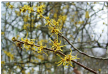
Witch-hazel Flowers

Our native witch-hazel is blooming now with spidery yellow flowers along the branches of a spidery shrub.