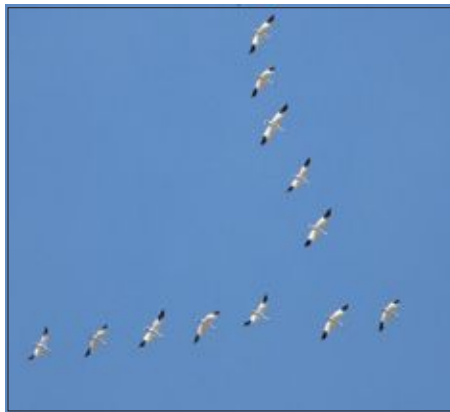
Snow Geese

Snow geese nest in the arctic and winter across the mid-latitudes of the U.S. As high flocks head south, migrating snow geese make a higher-pitched, almost screechy call, different from Canada geese.