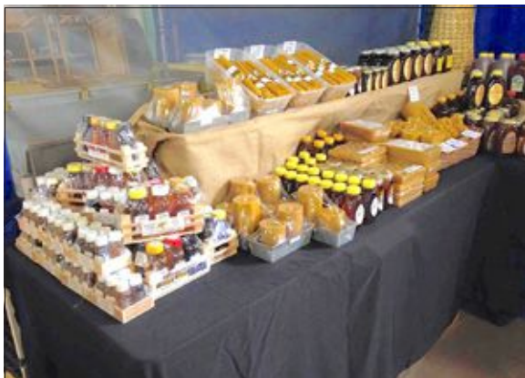
Honey Market has beeswax in many forms and gift packs with a variety of honeys.