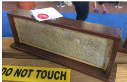
Frame of Honey exhibits showed how incredibly perfect (near perfect) honey bees fill every cavity.