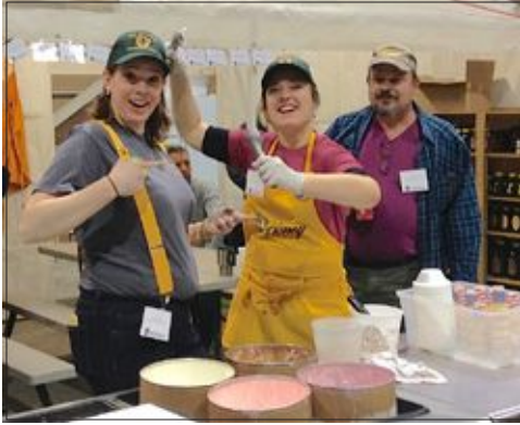
A (Alyssa, Danica, Al) Fine day at the Food Court. A little down time between customers.