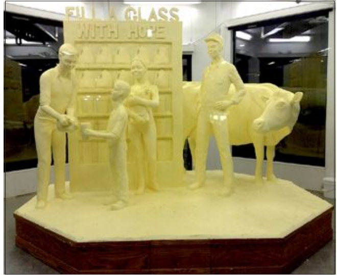
This year's butter sculpture depicts the PDA program of sending surplus milk to local food banks.