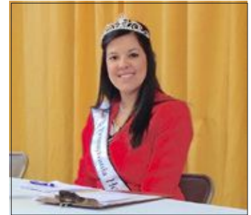
Princess Blair was a 'celebrity' judge for the Angel Food Cake contest.