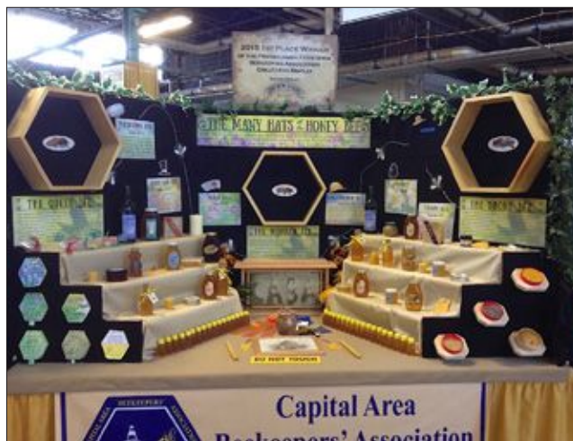
First Place County/Association Collective Exhibit by Capital Area Beekeepers Association, “The Many Hats of the Honey Bee”. Note the deep frame of honey with the initials, “CABA”. 1 st place sponsor is Dutch Gold Honey.