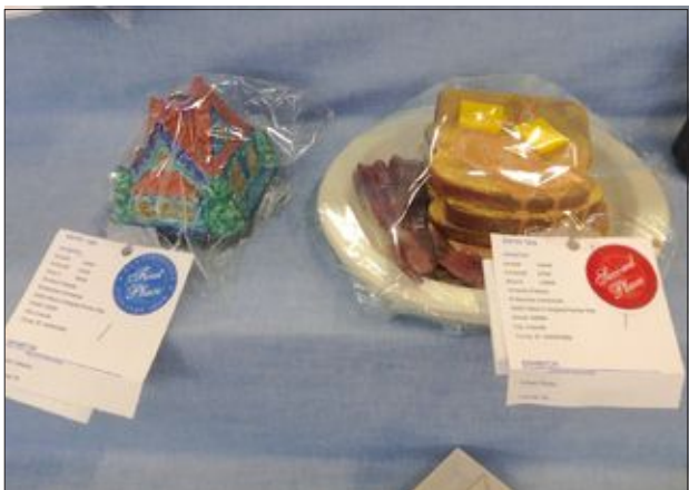
Mold or Designed Painted Wax is an interesting class that brings out some creativity.