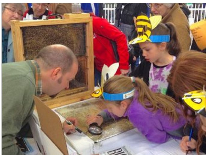
Young scientists study the varroa mite. Many good questions and eager learners.

Honey Baked Goods Competition and Exhibit PA State Farm Show 2015