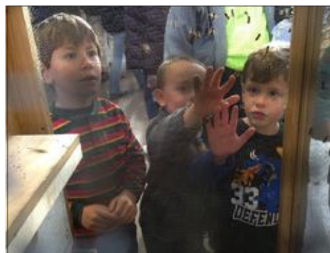
You can touch, but don't push. No, they won't sting through the screen.