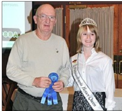
Annual Conference, Nov. 2012